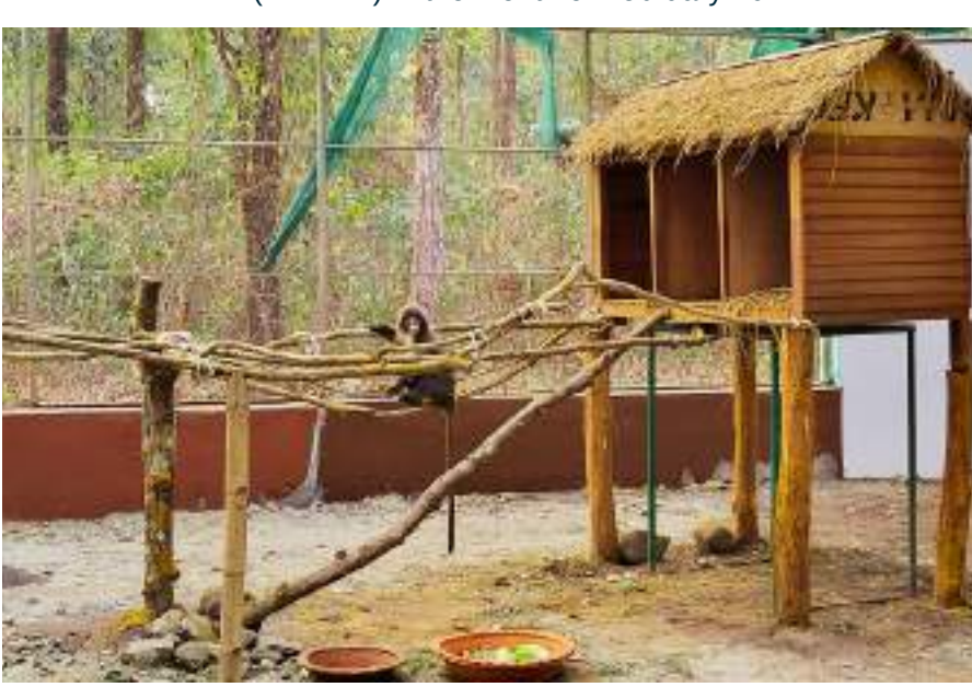
Habitat enrichment in Spectacled Langur enclosure.