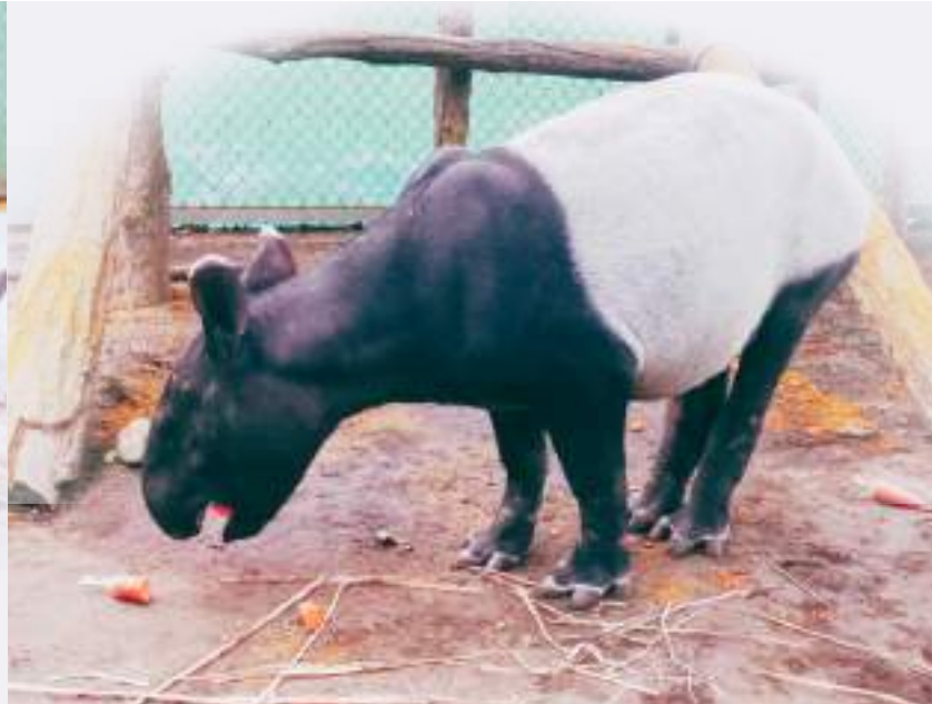
While observing the rescued Malayan Tapir at the Bengal Safari Veterinary Hospital, the veterinary team was closely monitoring its condition.